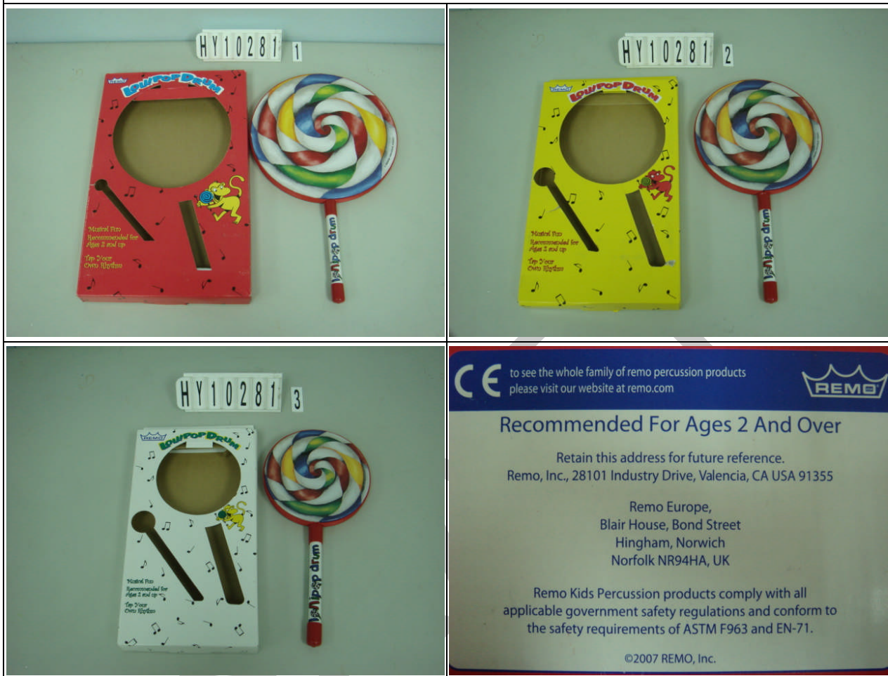
Sample picture (As received)